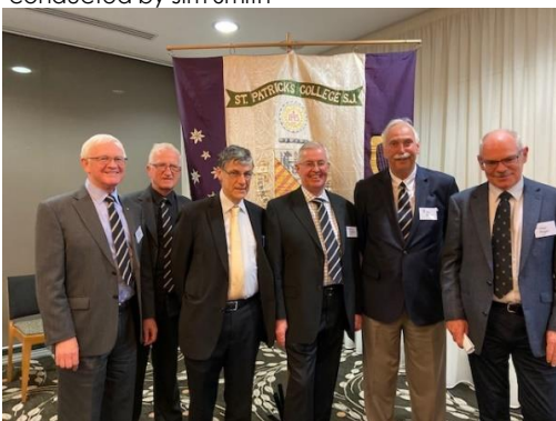
Six of the 2019 Committee stand proudly before the Banner