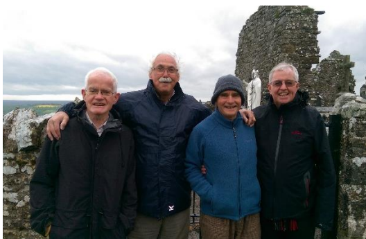
Climbers atop Hill of Slane (in icy winds and drizzle) where Patrick in 432, aged around 40 years, returned to Ireland and first lit a bonfire proclaiming the Christian alternative to pagan Druidic beliefs.