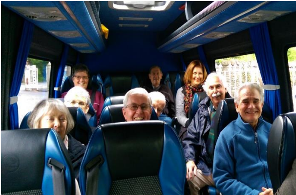
"Patricians All" - setting out in tour bus around Dublin on first morning Wed 9 May

While each couple took probably 200 to 600 images of their interests in Ireland, the following are a record mainly of our St Patrick, Jesuit and spiritual experiences. (The abundant sight-seeing, fun, food, music, genealogy searches & visits and the group's Irish history learnings can be provided by the participants and from the SPOCA Digital Image Library.)