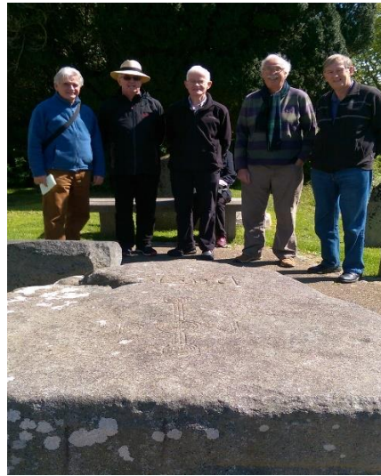
Patrick dies in 461 in nearby Saul and is buried here at Down Cathedral, built/rebuilt in 400s by Christians, in 1000s by Augustinians, in 1183 by Anglo-Normans, destroyed in 1316 by Bruce of Scotland, then rebuilt in 1512. Believed buried under this stone are the three principal Irish saints - Patrick, Brigid and Columcille