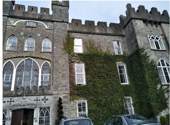
Front façade of Clongowes Wood Jesuit College for 450 boarders, 30 kms SW of Dublin. Castle built in 1450 & bought by Jesuits 1814. Joseph Lentaigne SJ was Rector in 1855-58 and first at SPC from 1865.