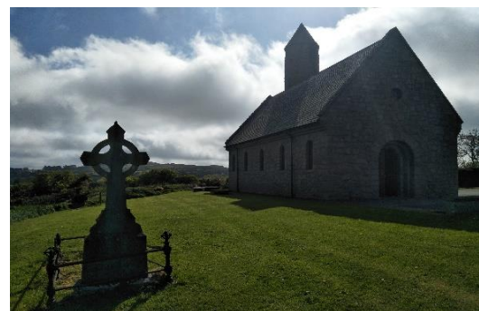
The first church built by/for Patrick in Ireland nearby at Saul in 430s. Original destroyed by Vikings in 700s and the subsequent Augustinian Priory (1100s) also destroyed in early 1300s.