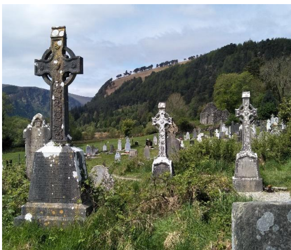
Graveyard in the ruins of Glendalough abbey, community and tower, established by Kevin in mid-500s on shores of a beautiful lake and hills in Co Wicklow.